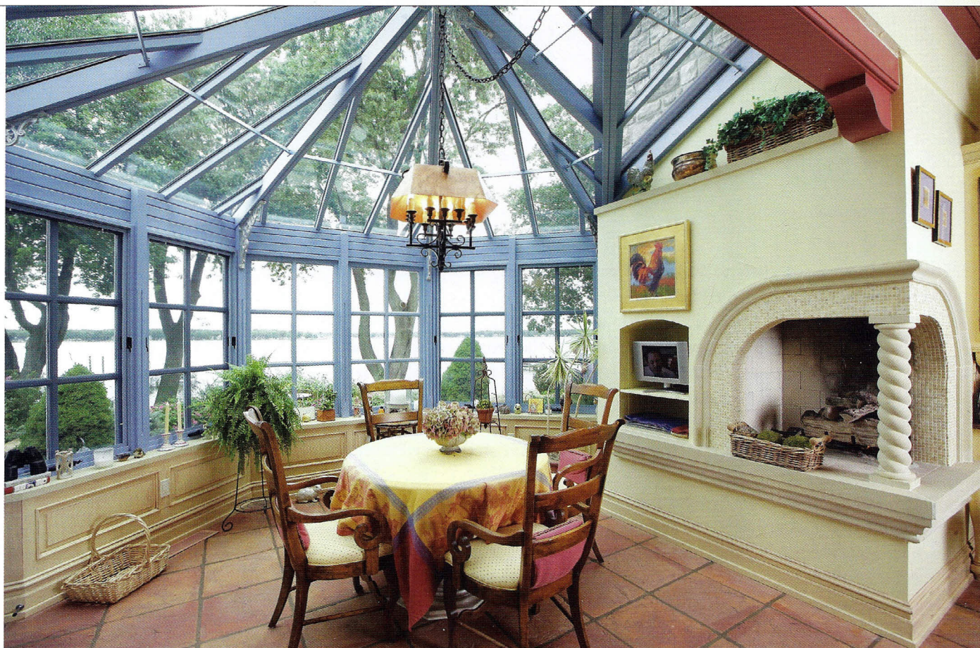
The cream-and-blue palette of this informal conservatory space in Holland created by Via Design and crafted by Scott Christopher Homes complements the home's Country French décor.