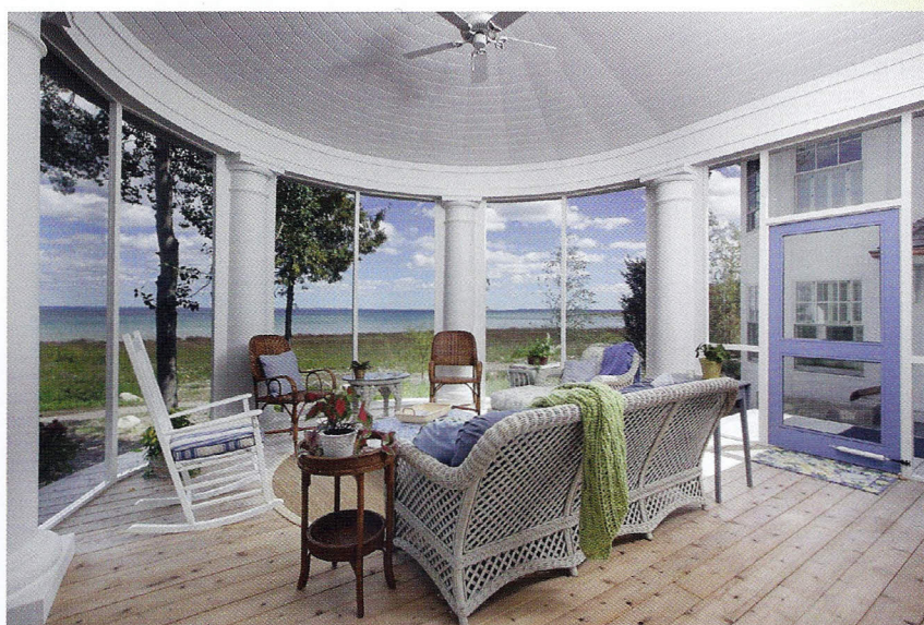
This Omena-based screened-in porch designed by Via Design and built by Scott Christopher Homes in Grand Rapids allows for virtually unobstructed views and unhindered breezes from the nearby lake, while bleached white oak flooring lends beachside ease.

Clients often wish to pair this design feature that harkens back to the turn of the last century with retractable screens, fireplaces and heated floors to extend enjoyment of their outdoor room by one month each in spring and fall, the builder says.